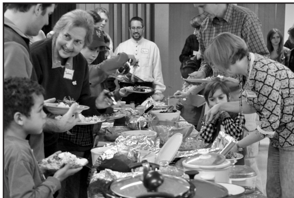
Members enjoy the potluck at the Annual Meeting.